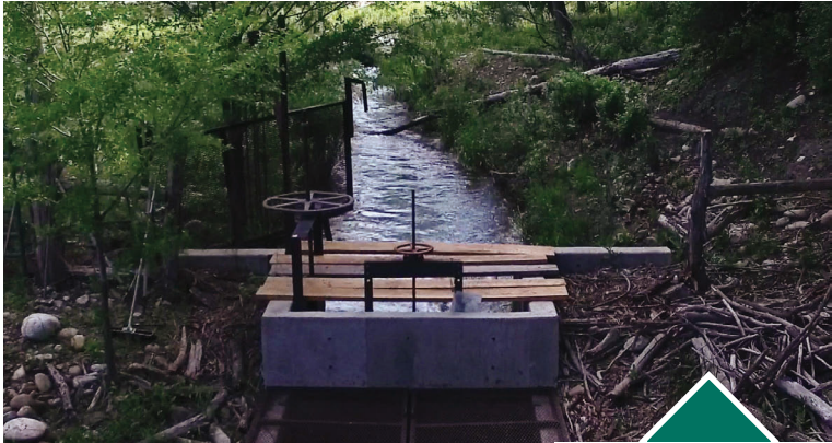
“Most years we didn’t even get any water, but now with the new diversion structures and screens we have in place in front of piped ditches, we’ve seen leaps and bounds in (improved) efficiency. The diversions can handle high water really well and then still divert water under low flows.” —Ben Wolcott, Wolcott Ranch, Mancos, Colo