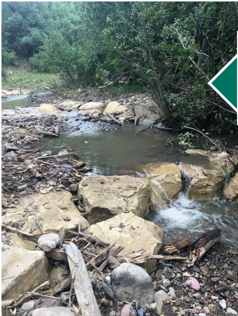
Even during low flows, the improvements provide places for fish to survive and enable irrigation water to flow.